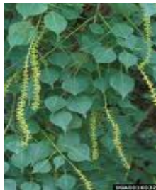
Chinese Tallow' pictured above

For a complete list of exotic invasive plants and trees, visit the Florida Exotic Pest Plant Council at: http://www.fleppc.org/