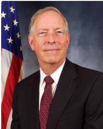
Mayor Charles Lacey