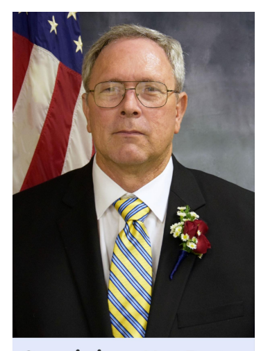
Commissioner Matt Benton