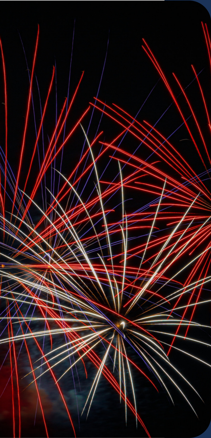
Celebration of Freedom