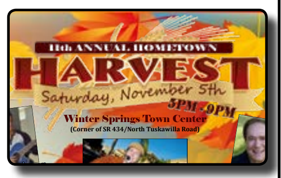
Hometown Harvest 2016 pg.17