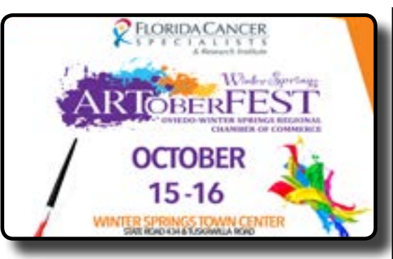
ARToberFEST 2016 pg.16