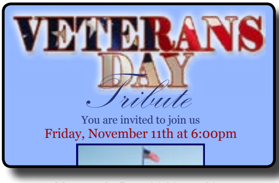
Veteran's Day 2016 pg.18