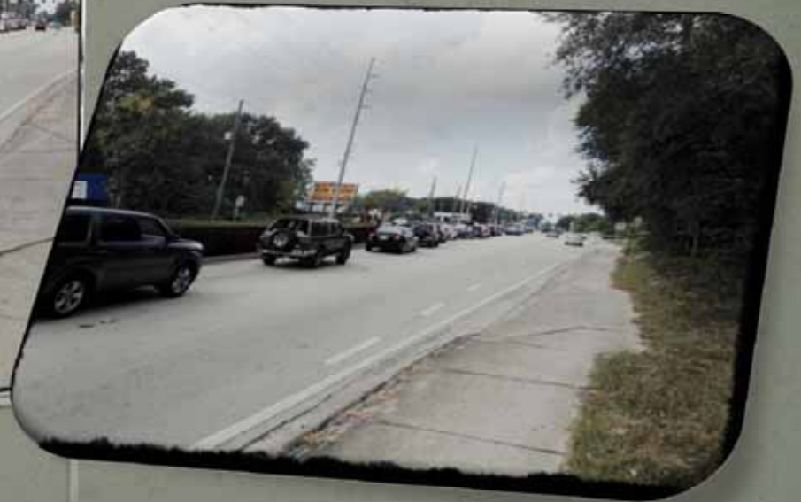
SR 434 Streetscape Project – Current Condition